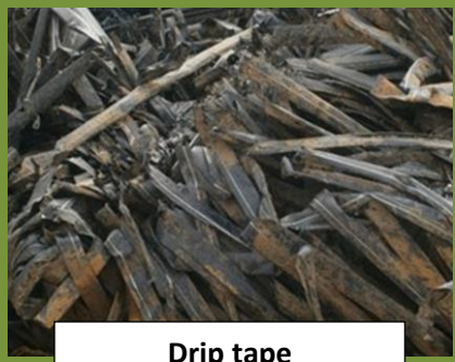
Drip tape cut to 4 foot sections

Farmers prep: Shake off loose dirt and keep plastic DRY.