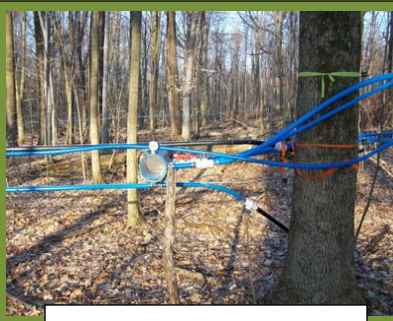
Maple tubing cut to 4 foot sections